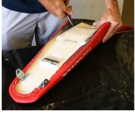
3 - Stretch the cover to the back. Add a few staples in the rear area.